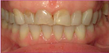
▲ Retracted view, pre-treatment.