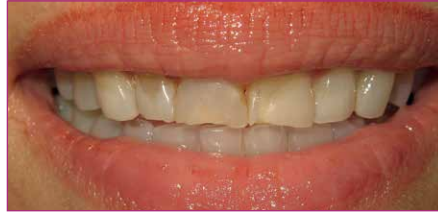
▲ Close-up of pre-treatment natural smile.