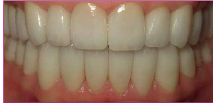
▲ Retracted view, post-treatment – Note lower restorations are longer.