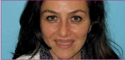
▲ Full face Before.