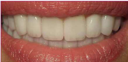
▲ Close-up of beautiful new smile.