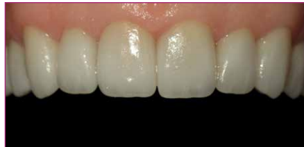
▲ Note the texturing and translucency achieved